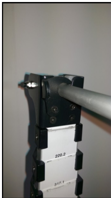
Folding arm bracket and safety catch.

Each section has a lock button. Always make sure button is engaged before extending the next section. Push button in to release section again.